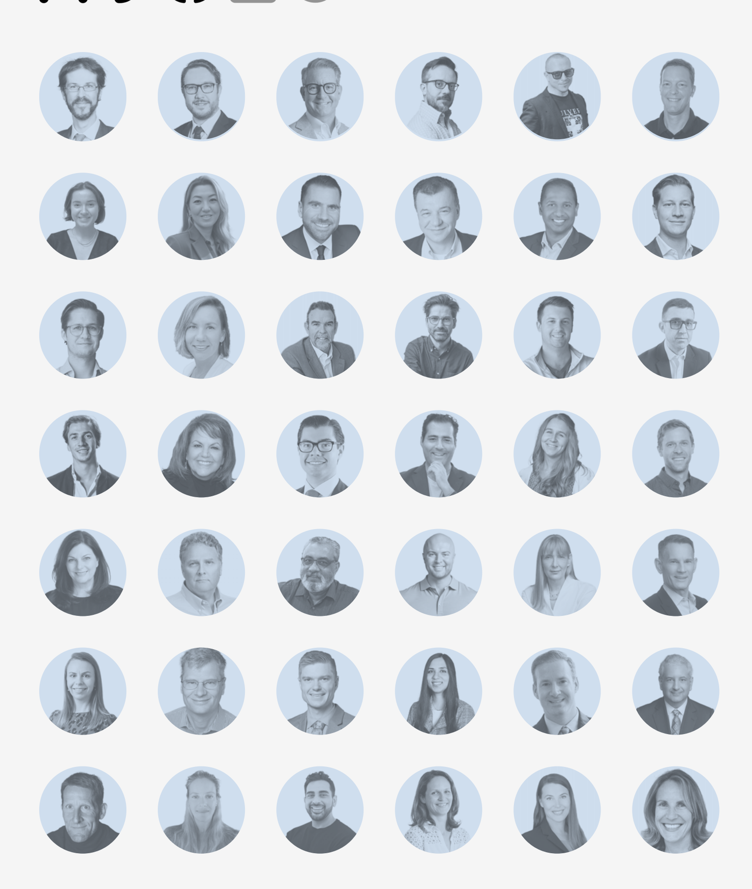
The Hotel Yearbook Foresight and innovation in the global hotel industry