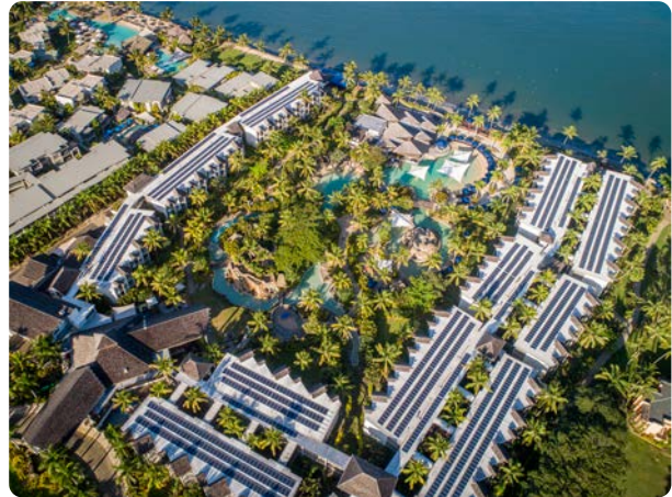
Radisson Blu Resort, Fiji Denarau Island, which has one of the largest PV installations in a Pacific resort