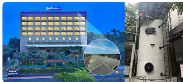
Radisson Blu Hotel, Bengaluru Outer Ring Road which is the first LEED ZERO CARBON certified hotel in Radisson Hotel Group's global portfolio including a photo of the biogas installation