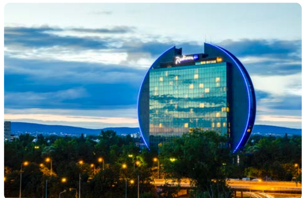
Radisson Blu Hotel, Frankfurt with large-scale hydrogen fuel cell installed